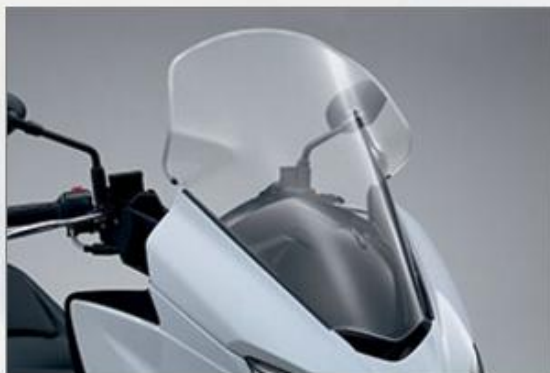
Large Wind Screen