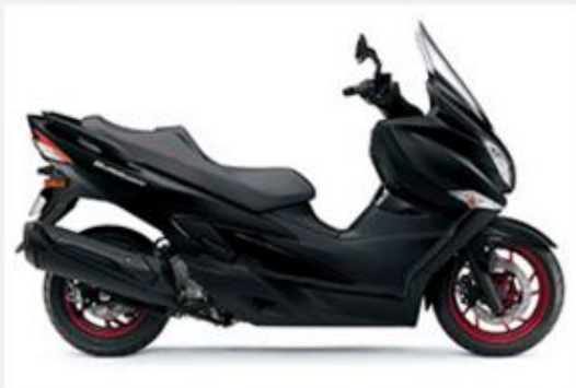
Metallic Mat Black No.2 (YKV)