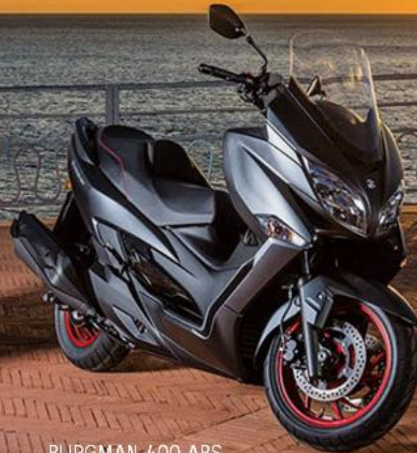
BURGMAN 400 ABS