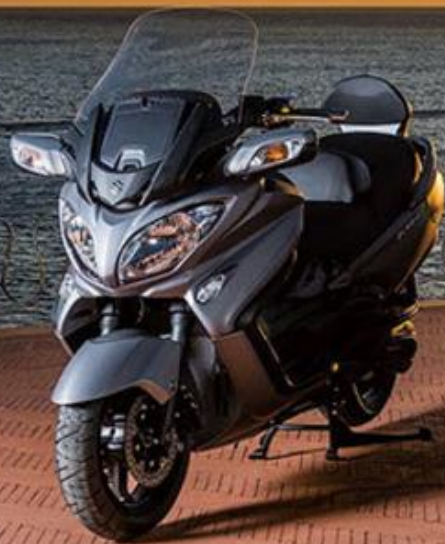
BURGMAN 650 Executive

You want to look your best, whether commuting to work or enjoying a ride with a special person on your own time. You want your ride to handle and perform well, while also reflecting your keen sense of style. The BURGMAN 400 delivers on all fronts. It's ready to turn heads on the streets. It's equipped to carry you wherever you want to go, and to do it in style. It's the Elegant Athlete.