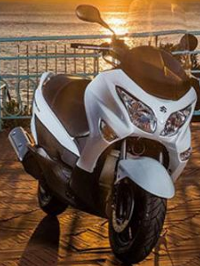
BURGMAN 200/125 ABS