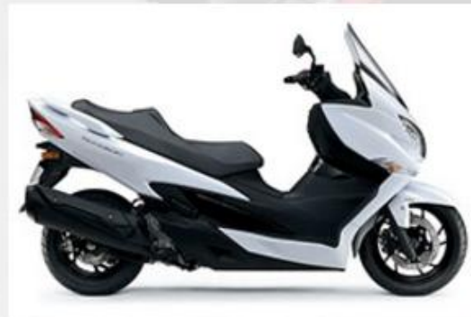
Pearl Glacier White (YWW)