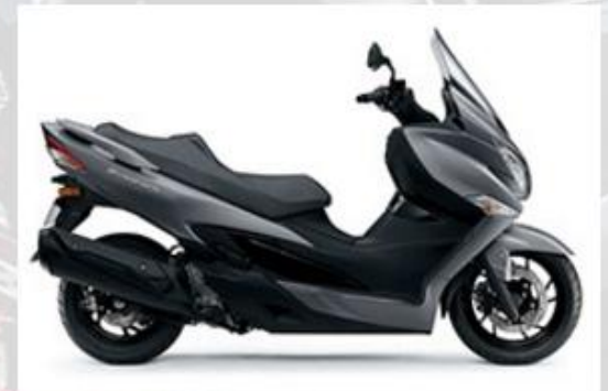
Metallic Mat Fibroin Gray (PGZ)